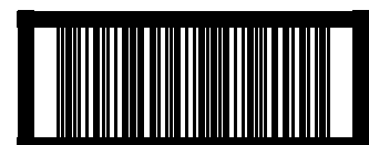
GVP9-XL-1 Case UPC